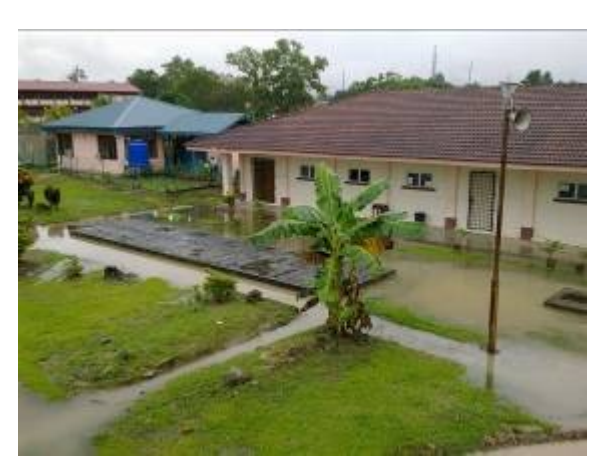
The walk way was totally submerged