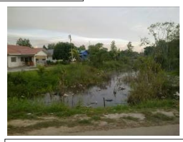
Aquatic lives are also affected by the irresponsible act of littering and dumping rubbish