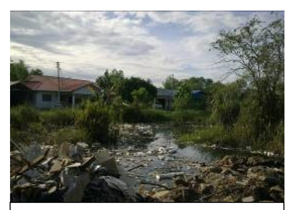
Domestic waste thrown by the communities living around the school