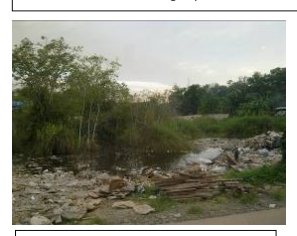
Being a reclaimed mangrove swamp area the school still has remnants of it