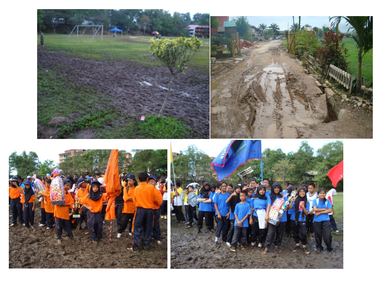
AFTERMATH OF THE FLOODING, THE SCHOOL STILL WENT ON WITH THE PRIOR PROGRAMME